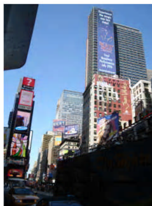
How to advertise

Final day in New York and an early start to the Guggenheim and Museum of Modern Art. A little disappointed at Guggenheim as several galleries were closed and restoration of the exterior of the building also underway but couldn't do justice to the MoMA in the short time left especially the French Impressionists. Meet back for the final packing - interesting! Zippers are forced closed. A taxi ride from hell as we speed through Queens and on to JFK. We see daughter Natasha off on Air Tahiti Nui to Sydney and join Jet Blue for our short flight back to sleepy Burlington.