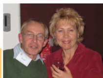
Happy Club Members and Guests.